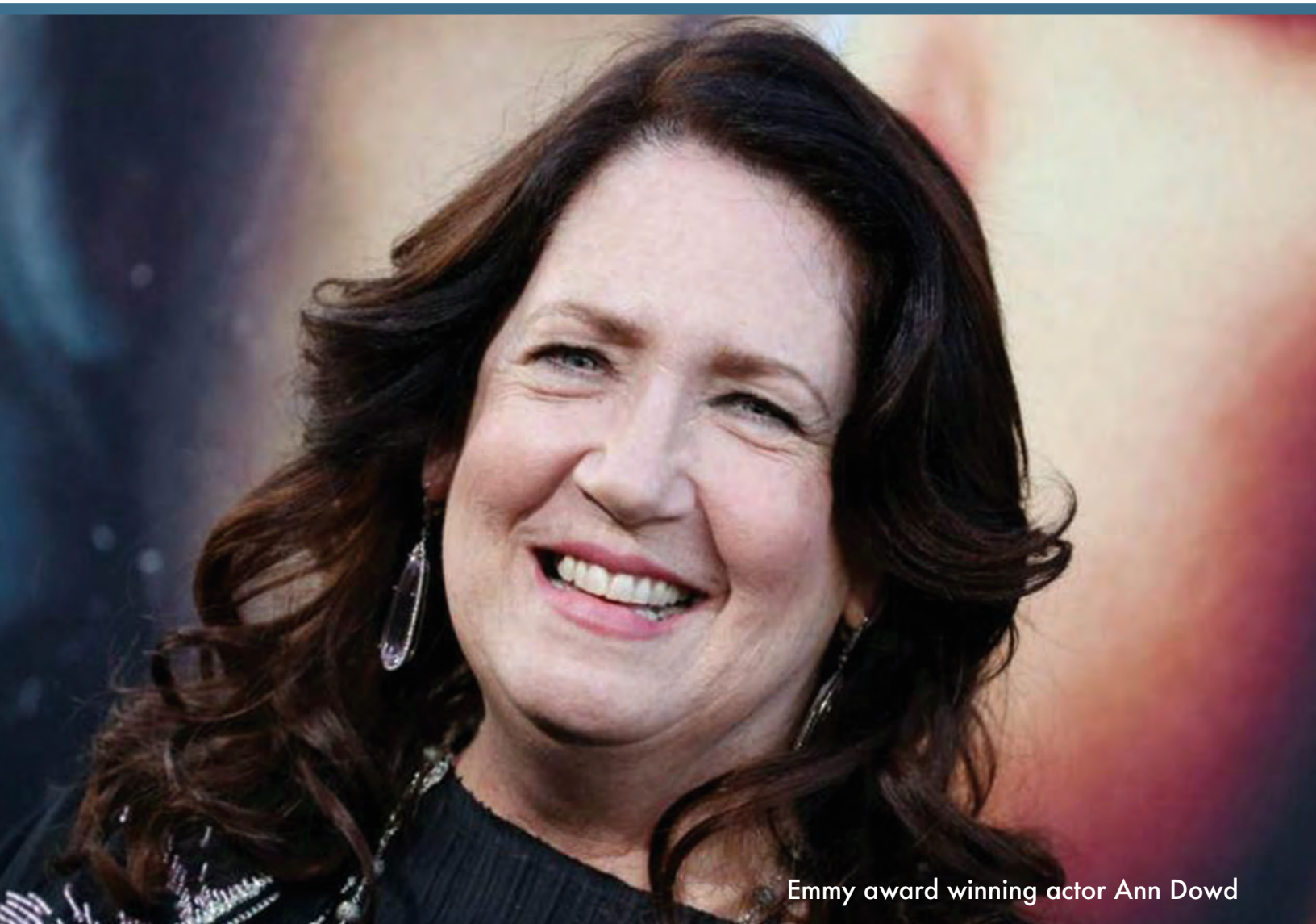
Emmy award winning actor Ann Dowd

a set about parenting. She especially hit home with her funny stories about her young child living with autism by sharing anecdotes that made the audience laugh, cry and then laugh again. Most families in the audience totally understood the challenging situations she described with her distinct and razor sharp humor. Rosie shared enough love with her dynamic presence to lift the hearts and minds of all present. Rosie proceeded to do an impromptu request from the stage to help Triform raise $100,000. With her help and the support of the many friends of